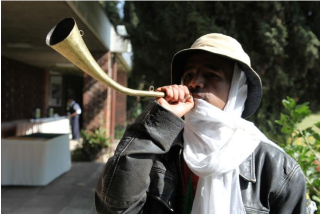
Traditional horn blower announcing the sessions to start