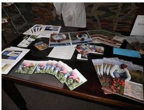
Participants setting up their booths at the Infocenter

See photos from the fair at http://tinyurl.com/sfaddisphotos